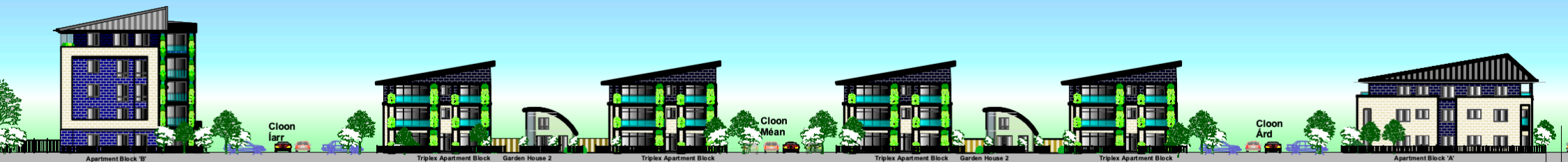
East Park East Elevation