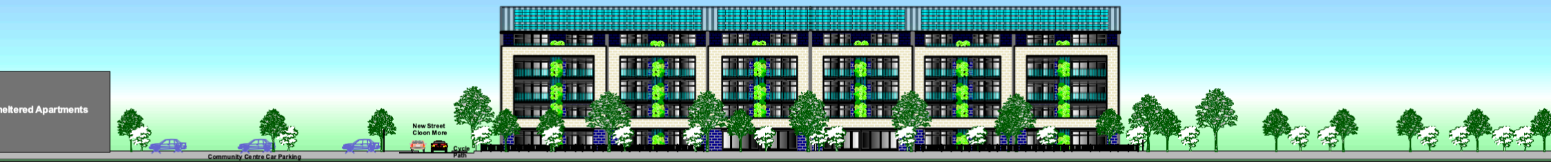
Cloonmore Avenue South Elevation